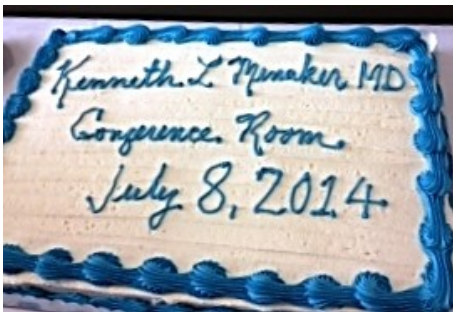
Cake celebrating the dedication