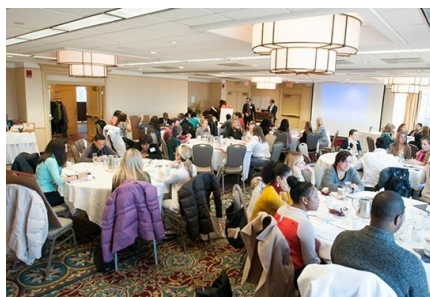
Ellison 12 Retreat